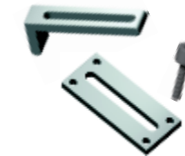
Plate Locator Kit

Secures acrylic plate to table top. Two (2) Kits available: Large and Small. Includes three (3) sets of: Plate, clamp, M6 and M4 thumb screws.